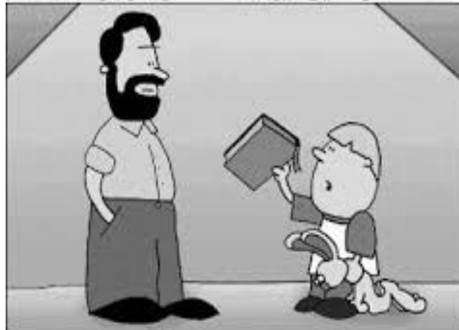
DAD, I NEED YOUR HELP TO FIND OUT WHERE IT TALKS ABOUT THE EASTER BUNNY IN THE BIBLE 04-13-2006

Spring is here and WHBC kids are full of that joyful energy that comes with the changing of the seasons. Bible drills are in full swing and the Regional drills will be coming up April 10th. The Awana kids are on the home stretch of learning God's amazing words for this school year and plans are in the works for a summer program to continue the spiritual growth we've seen in our children. On Saturday April 8th we will have a community wide Easter egg hunt with games and crafts for ages 3 thru 6th grade. The time will be 2-4pm. We are collecting candy and filled eggs for this event and appreciate all your help.